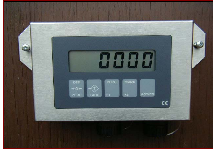
Apex Junior Digital Display Unit